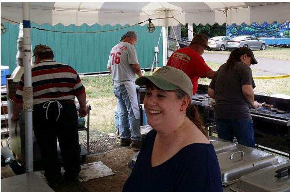
Photo above and to the left are of the SAL crew at the TCS All Class Reunion.

Many thanks to the crews at both Grassroots and the Reunion. Your dedication is truly appreciated.