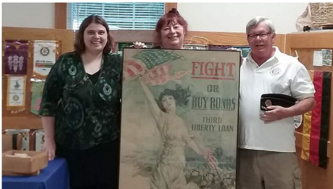
Picture donated to the American Legion by the Trumansburg Rotary.

The Post Team walked in the July 15-16 event at Ithaca College on behalf of the members of Arthur E. Bouton Post 770. Thank you to all who supported and participated in the event.