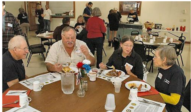
Photos of the Veterans Day Breakfast by the Trumansburg Methodist Church on Sunday, November 8th.