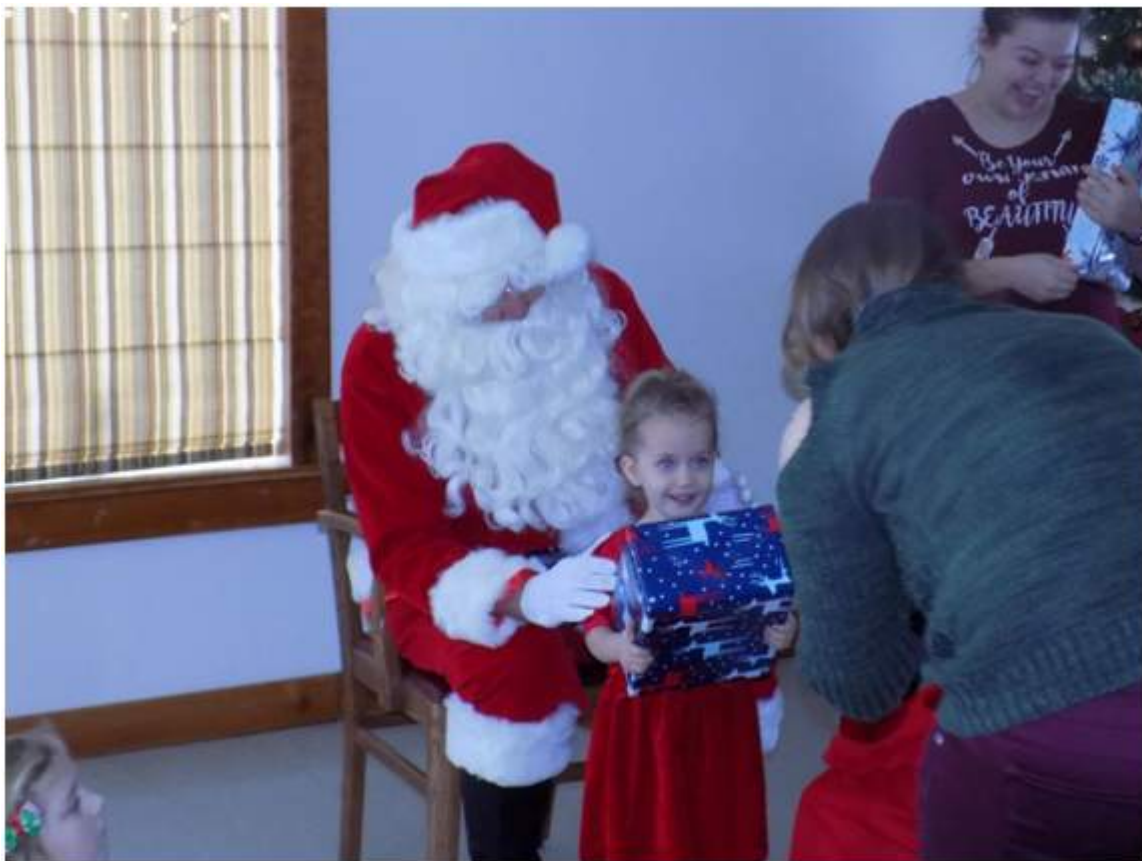
Annual Kids Christmas Party hosted by The Auxiliary!