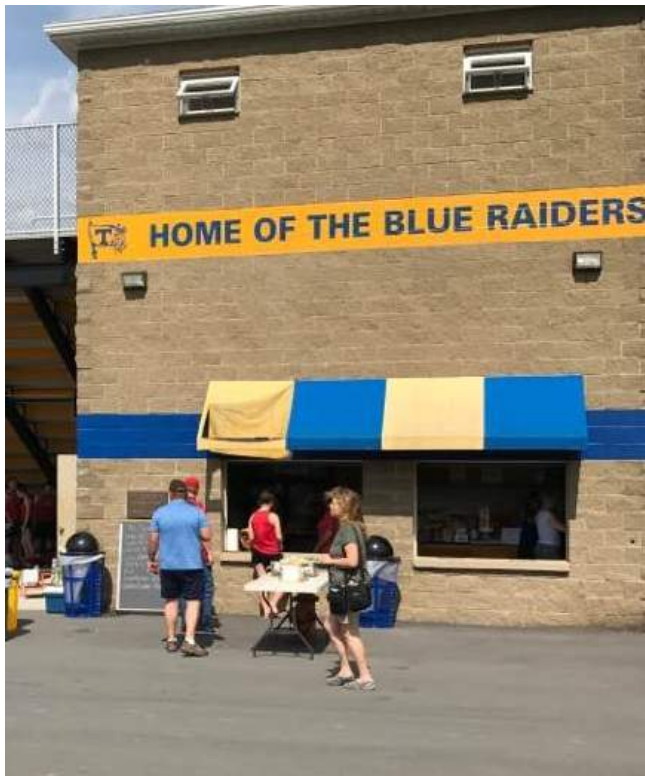
Cooking at the IAC Track Meet