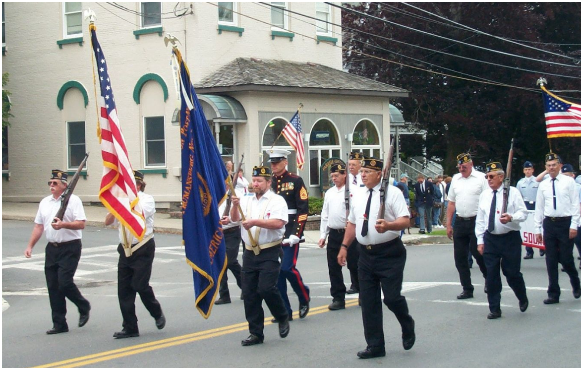
Memorial Day Parade – May 2001