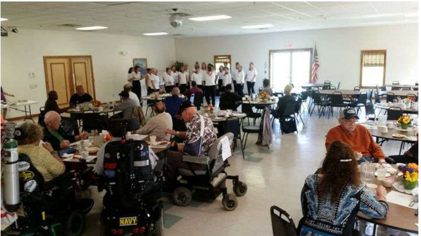
Bath Veterans Visitation