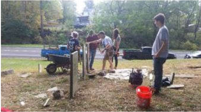
Jacob's Project at Amish Settlement Cemetery